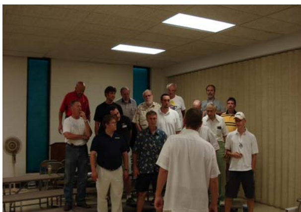
Basses and Baritones practicing