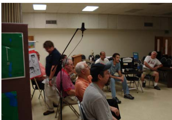
Leads and Tenors critiquing